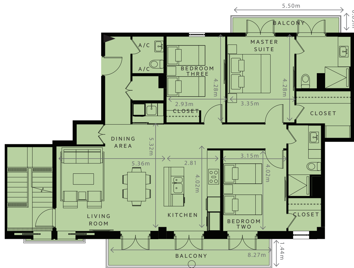
OCEAN CLUB VIEW FOURTH FLOOR